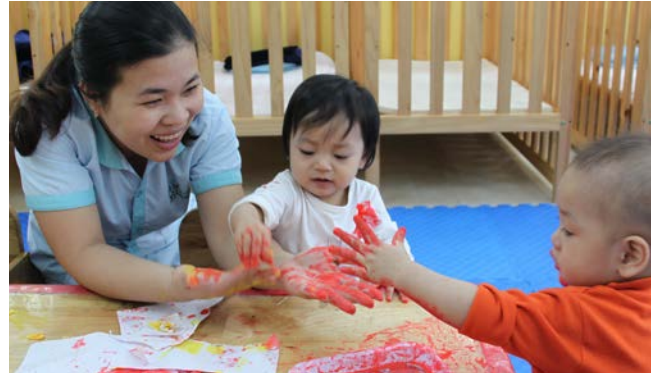
Caregivers trained by OneSky are better equipped to provide quality care and early learning programs so ensuring a future filled with opportunity for the children in their care.

This is in addition to the 240 trainees from home-based daycare facilities in Da Nang who progressed through OneSky training earlier in the year.