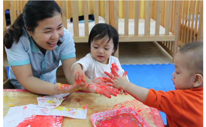
OneSky trained caregivers provide better quality care and early learning thus setting up the children in their care for a future filled with opportunity.

This is in addition to the 240 number of trainees from home-based daycare facilities in Da Nang who progressed through OneSky training earlier in the year.