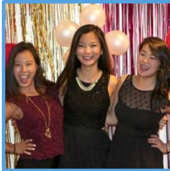
Students at Brown University

Sell gifts leading up to a holiday and offer to deliver to recipients in their dorms or homerooms on the holiday.