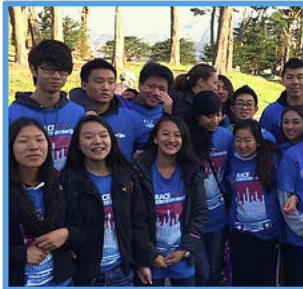
Students at Berkeley High School

Walk through dorms and offer to take out trash for cash donations. This has the added benefit of raising awareness about your club on campus.