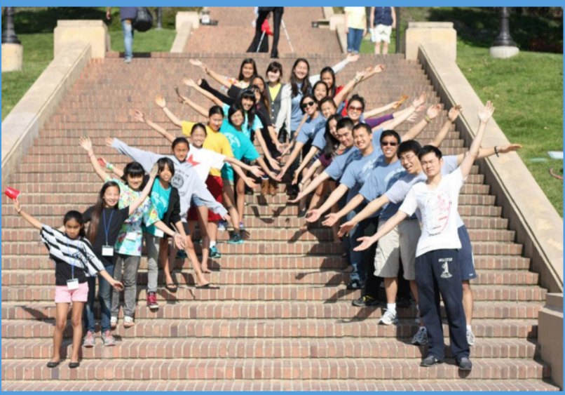
Students at UCLA

Sign up to run a 5K, half or full marathon. The more people on your team, the better!