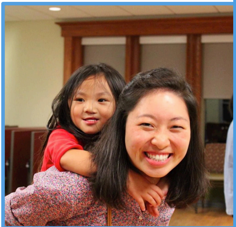
Student at Washington University in St. Louis

Give them clear expectations and let them know how much they mean to you.