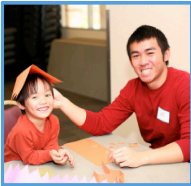
Student at UT Austin

Volunteering with kids through organizations in your local community as a mentor or tutor for a meaningful cause can be an incredibly rewarding experience. It also gives you an opportunity to build ties with your club members and attract new members interested in giving back locally.